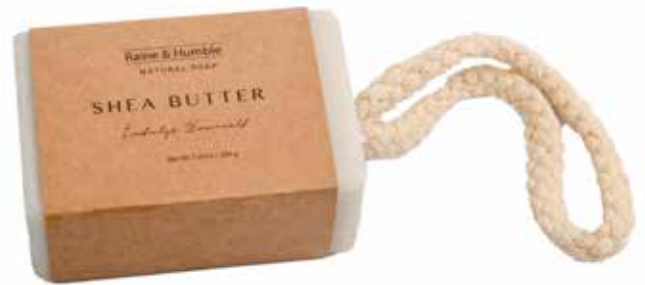
RHSOAP10 Shea Butter Soap-On-A-Rope 200g