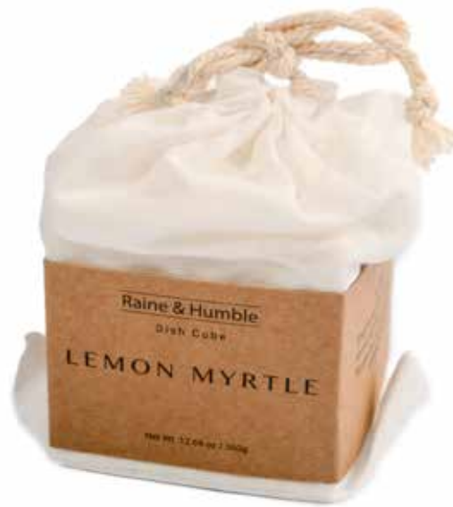
RHSOAP01 Lemon Myrtle Dish Soap Cube 300g