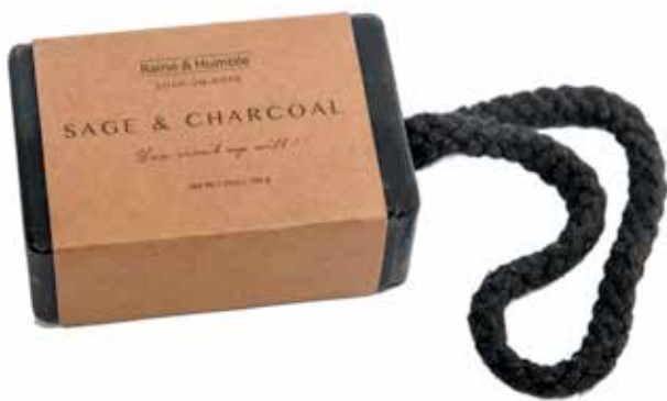
RHSOAP09 Sage & Charcoal Soap-On-A-Rope 200g