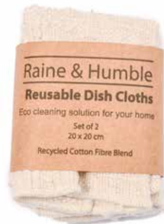
RHDC21667 Recycled Cotton Dish Cloths