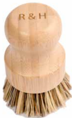
RHSOAP02 Bamboo Dish Brush